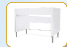
Support Stand (ASL)