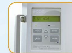
Sentinel™ XL Airflow Alarm