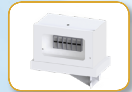
Circuit Board Protection